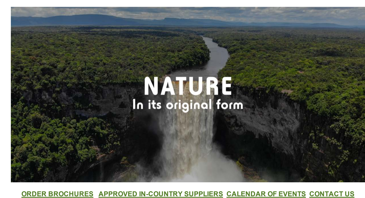
Dear Colleague, Welcome to the first edition of the trade newsletter from the Guyana Tourism Authority. We hope it

piques your curiosity about our beautiful, unspoiled country—the only English-speaking one in South