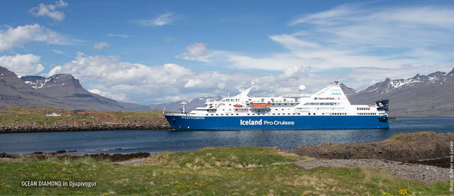
OCEAN DIAMOND in Djupivogur