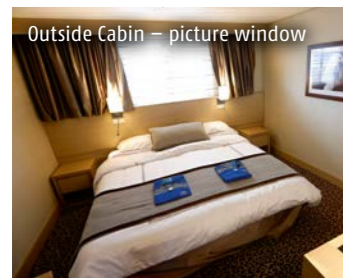
Outside Cabin – picture window

Iceland ProCruises terms and conditions: www.icelandprocruises.com